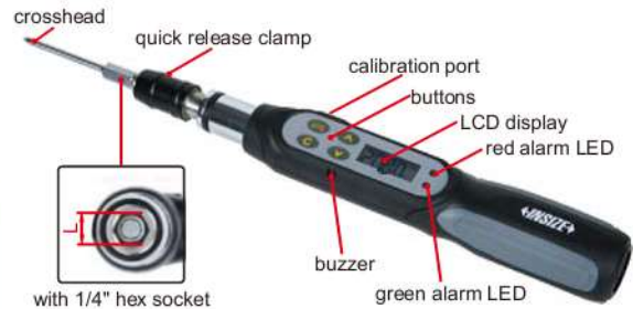
with 1/4" hex socket