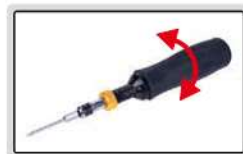
rotate the handle to set torque