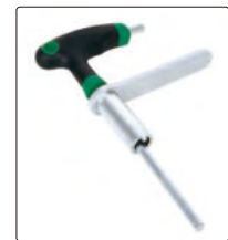
torque adjustment tool (optional)